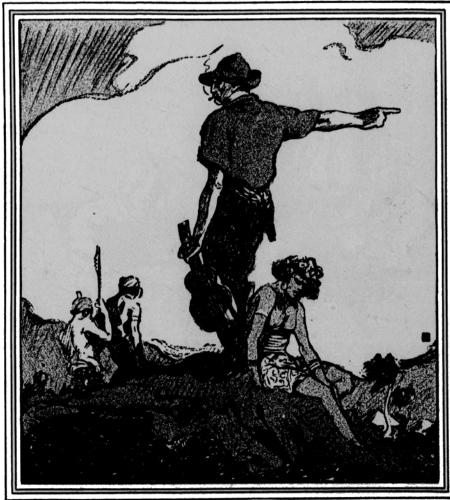
What had Tom done, save play ducks and drakes with life?

"Deuced warm day," he said with a bright apologetic laugh. "I've actually been asleep. Aren't we near home?"