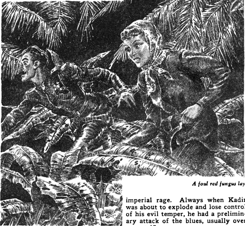
A foul red fungus lay

The guests stopped eating and eyed the Dictator apprehensively. They recognized the first symptoms of an