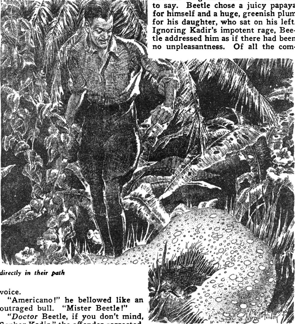
directly in their path

calmly selected a banana, skinned it, and took a bite. Kadir watched the daring man in amazed silence. The last of the banana was about to disappear when the Dictator found his