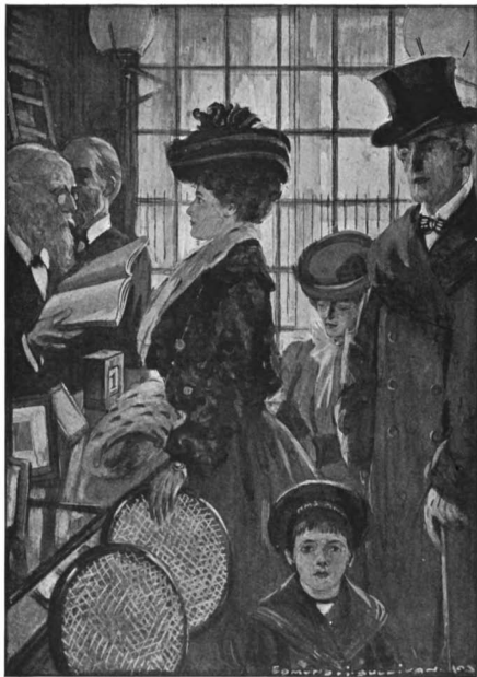
"'I have seen her in the flesh, here, in Oxford, day before yesterday.'"