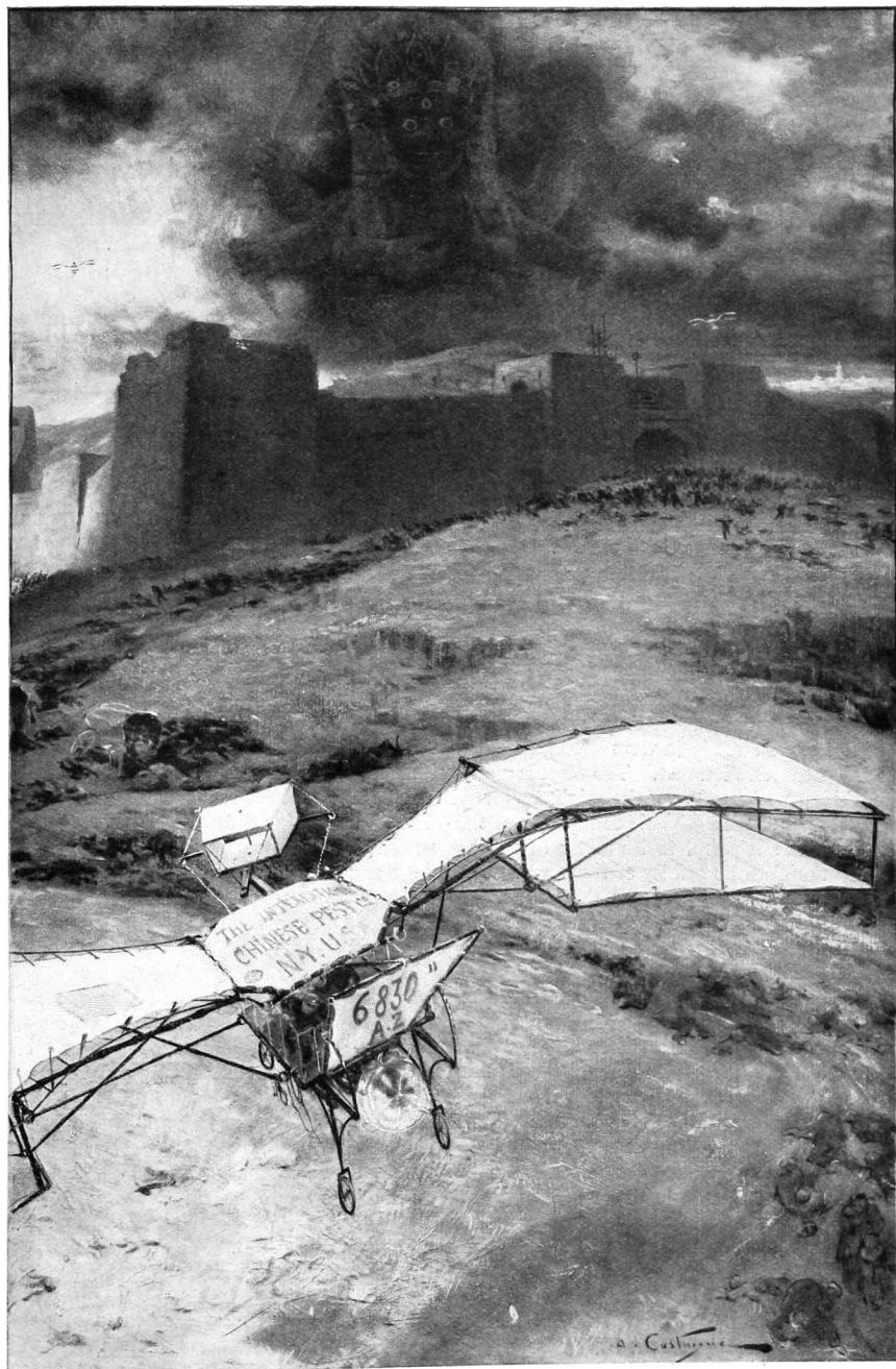
THE GREAT WALL OF CHINA AFTER THE UNPARALLELED INVASION OF 1976