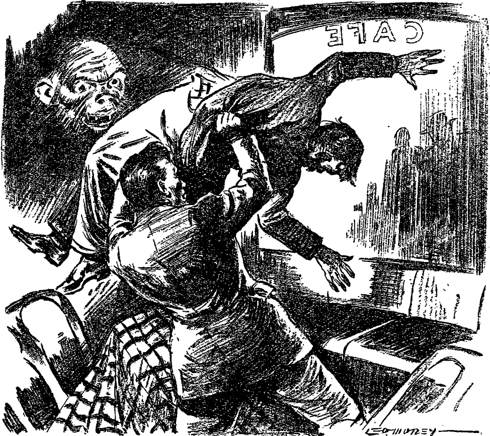
Bogash, berserk, hurled the organ-grinder through the window

Author of "The Man-Trap," "The Jailer of Souls," etc.