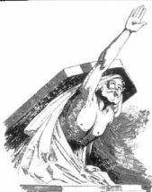
JULES VERNE'S TOMBSTONE AT AMIENS PORTRAYING HIS IMMORTALITY