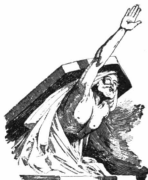
JULES VERNE'S TOMBSTONE AT ARNSEN PORTRAYING HIS IMMORTALITY