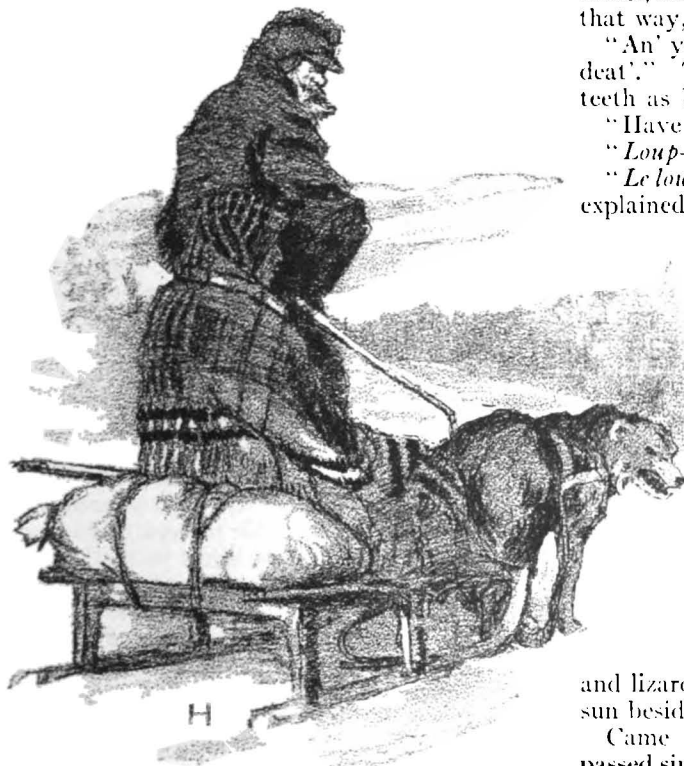
"THE DOG SWERVED, READY TO FACE THE THING-BEHIND."

Came many months till nine had passed since that March day when Victor Descartes had played at dice with Torkel Knutsson, and now within a