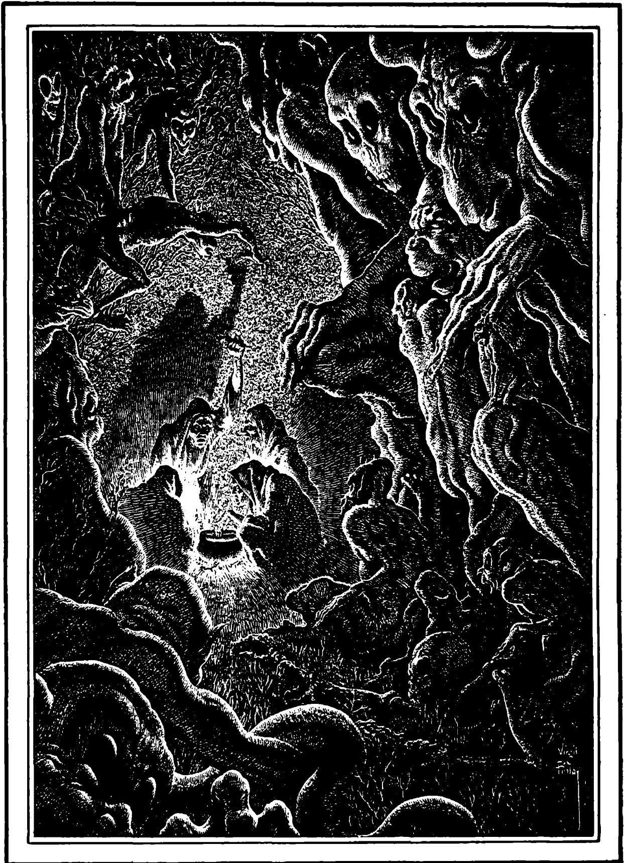
They knew that certain crones worshipped the devil there. . . .