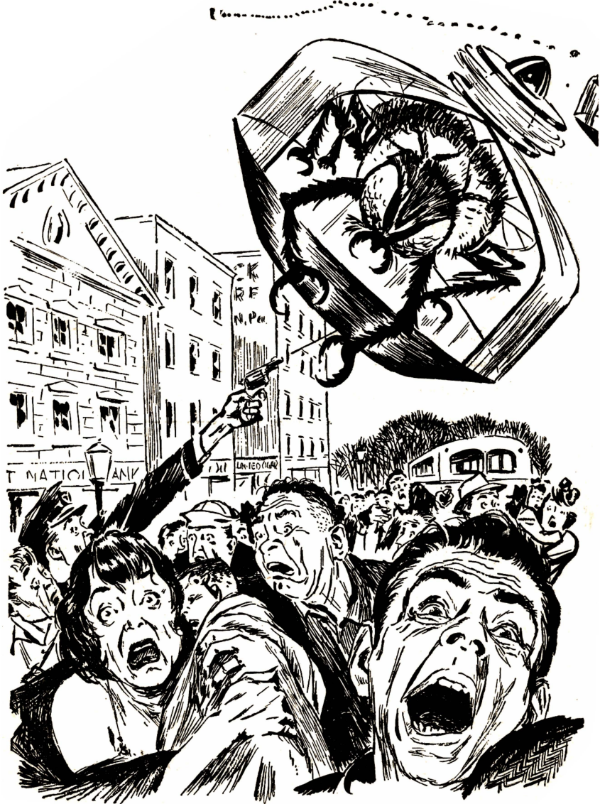
Panic reigned as the invader moved in