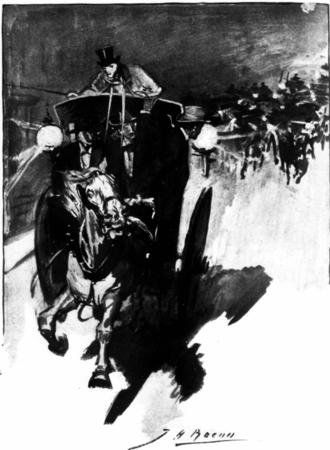
"ONCE A KID PUT HIS HEAD OUT OF THE WINDOW"

gloves, brass buttons, and on the butt of the old-fashioned Colt's revolver which hung at his belt. He addressed Freddie in swift Mexican. Freddie listened, nodding from time to time. Finally Freddie turned to the others to translate. "He says he'll get into trouble if