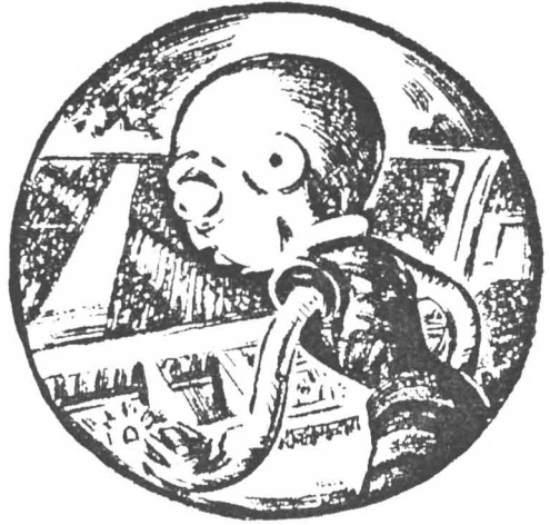
The green globe rose high over the harbor and the city held its breath

The globe moved; dropped swiftly until it rode just over the crests of the waves, then shot straight up with bewildering