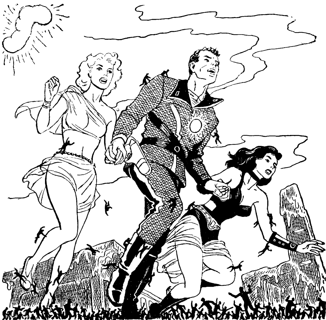
Supporting both girls, he continued on toward the temple

mark visible from windy horizon to windy horizon. Beside the building, as he dropped lower, he found Kenna's fluted silver space-boat. He swooped to a landing, half-expecting a bolt from her needle-beam. The port of the space-boat hung open, but she did not show herself as he ground to a halt on his crash-keel close by.