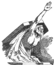
JULES VERNE'S TOMBSTONE AT AMIENS PORTRAYING HIS IMMORTALITY