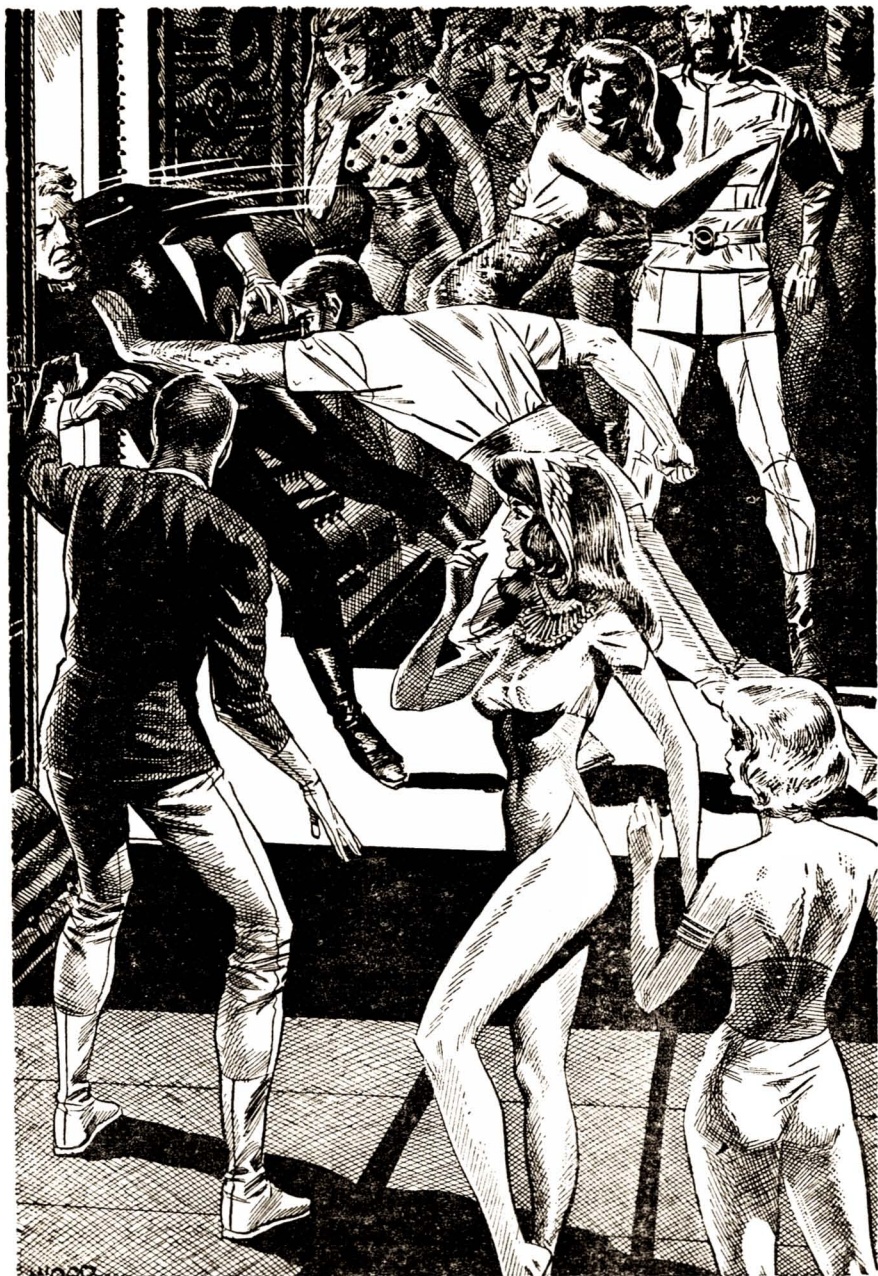
Dave gave the cop a shove into the Transmat...