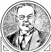
"SIR WILLIAM PERKIN" BORN 1838 DIED 1907