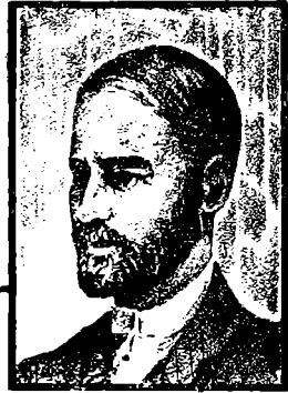
HEINRICH RUDOLPH HERTZ BORN 1857 - DIED 1894