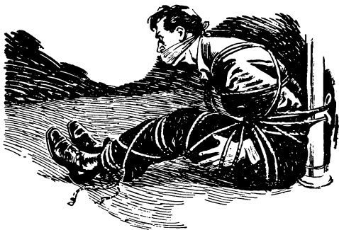
There he sat while the minutes ticked by—slowly, relentlessly

woman he meant to replace her with. She didn't nag and quarrel with him. She was a docile, tractable sort of wife.