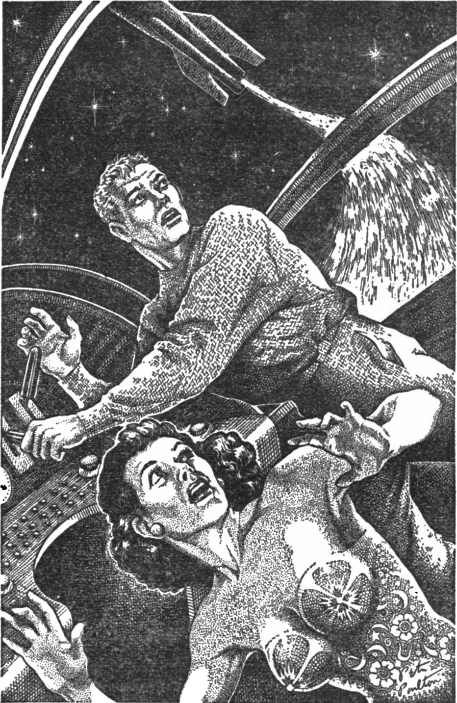
Air currents tossed the sky-sled madly, as Mitch fought the controls. The spaceship had screamed past them...