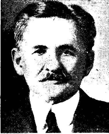
Albert Abraham Michelson

Americans were so prone to do. He was trying to play God and command light to stand still for him, as Joshua, a leader of Michelson's own race, had commanded the sun to halt, an age before.