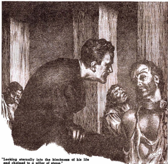
"Looking eternally into the blackness of his life and chained to a pillar of stone."

The woman started to obey. The man came nearer.