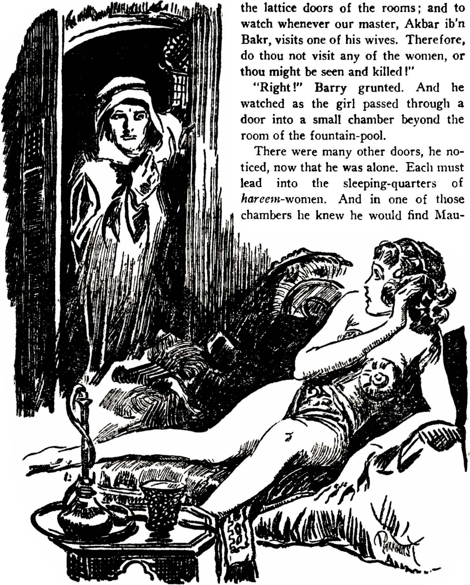
From his costume she thought he was the Shaikh returning and she moaned.

Again he nodded. "And you?" he whispered.