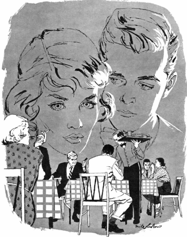
THE CHILDREN'S FUTURE WAS A SHADOW OVER THEM