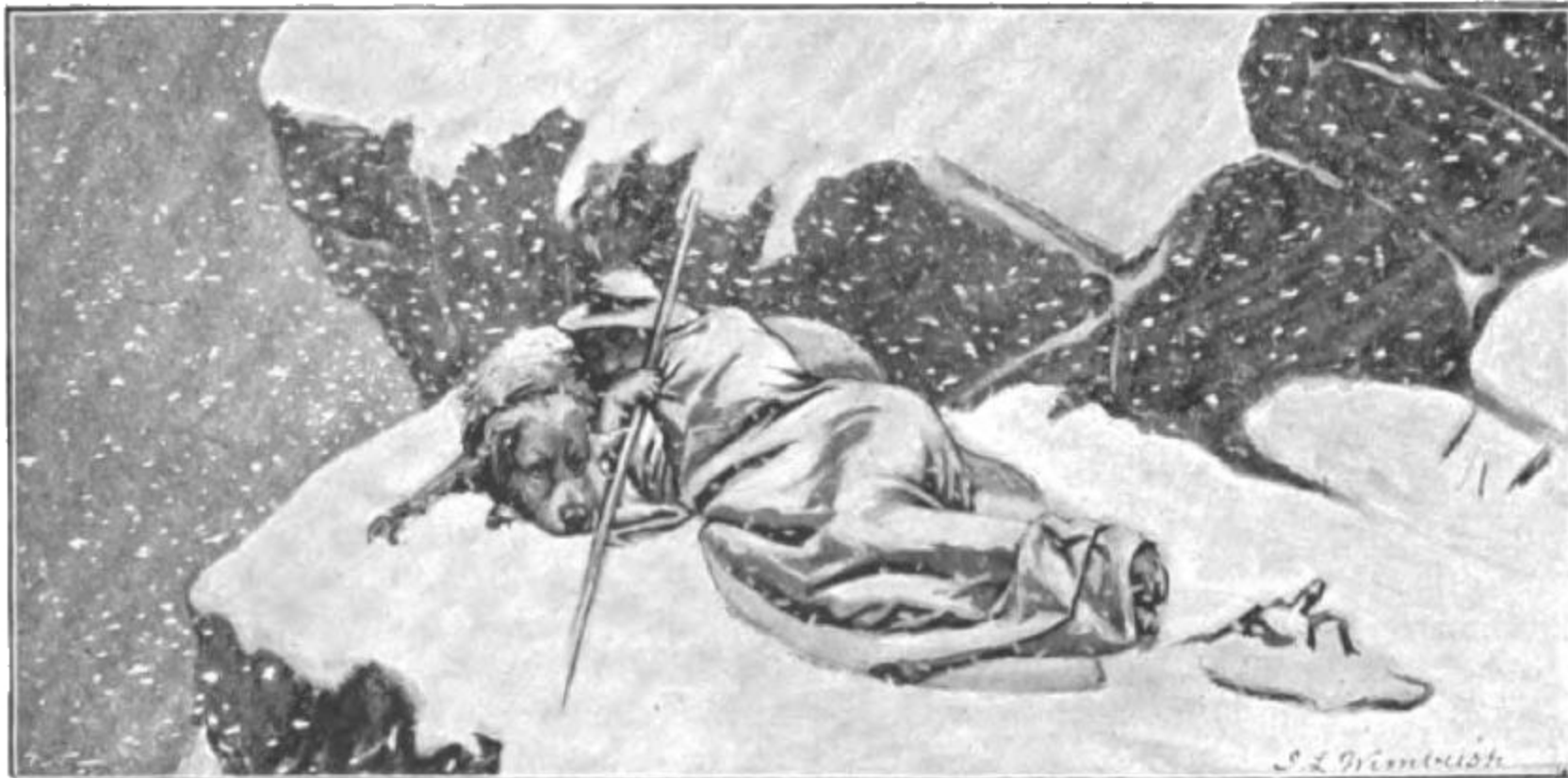
"THEY LAY DOWN TOGETHER."

They lay down together, the young man and