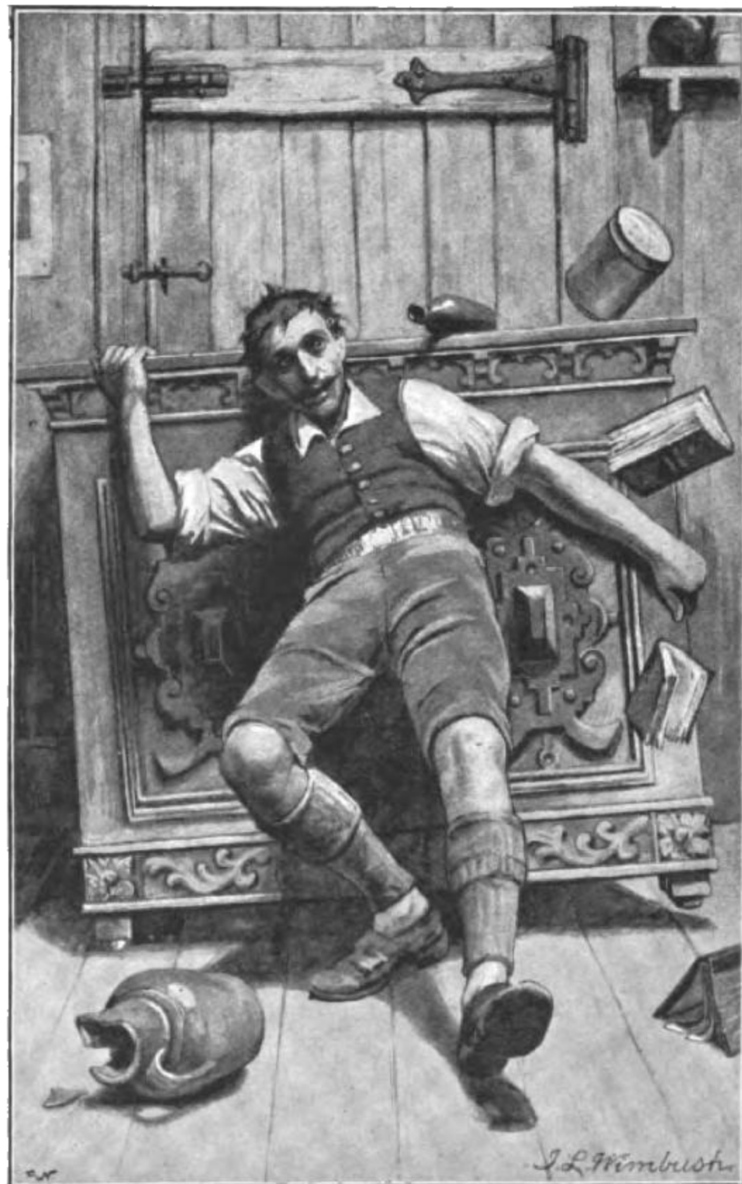
"ULRICH THREW HIS WEIGHT AGAINST THE OAK SIDEBORD."