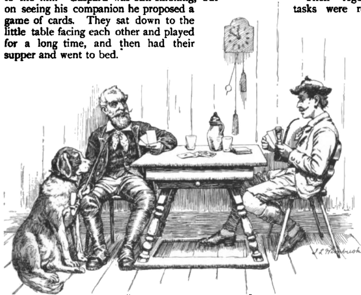
"THEY PLAYED FOR A LONG TIME."

The sun had by this time disappeared behind the high crest of Wildstrubel, and the young man wended his way once more back to the inn. Gaspard was still smoking, but on seeing his companion he proposed a game of cards. They sat down to the little table facing each other and played for a long time, and then had their supper and went to bed.