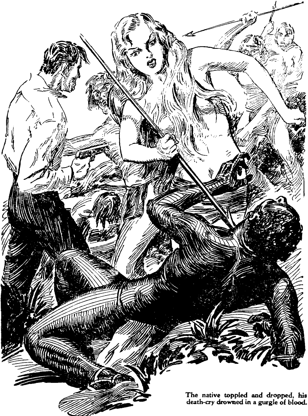
The native toppled and dropped, his death-cry drowned in a gurgle of blood.

tallest of them stood immediately before the bed. Jim could see only the back of a female figure, before which was a long, flat altar. And on the altar stood Marian, almost nude.