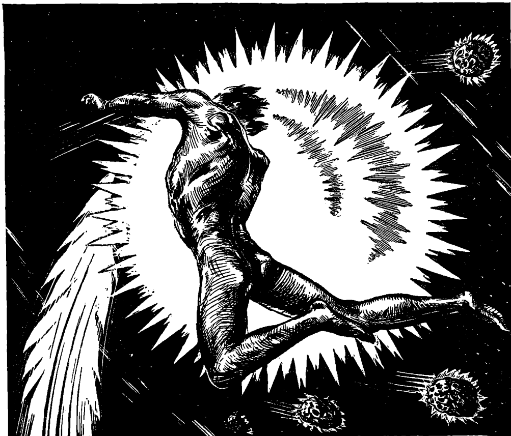
He sought to turn and flee.

The suns and the planets were moving. They sped like balls batted across a net by hundreds of players. They slid in ancient grooves, rotating and retreating, going back the paths of their orbits. A ball of raging fire looped at them. Thor paused in instinctive dismay; he sought to turn and flee, dreading the vast sun coming at him.