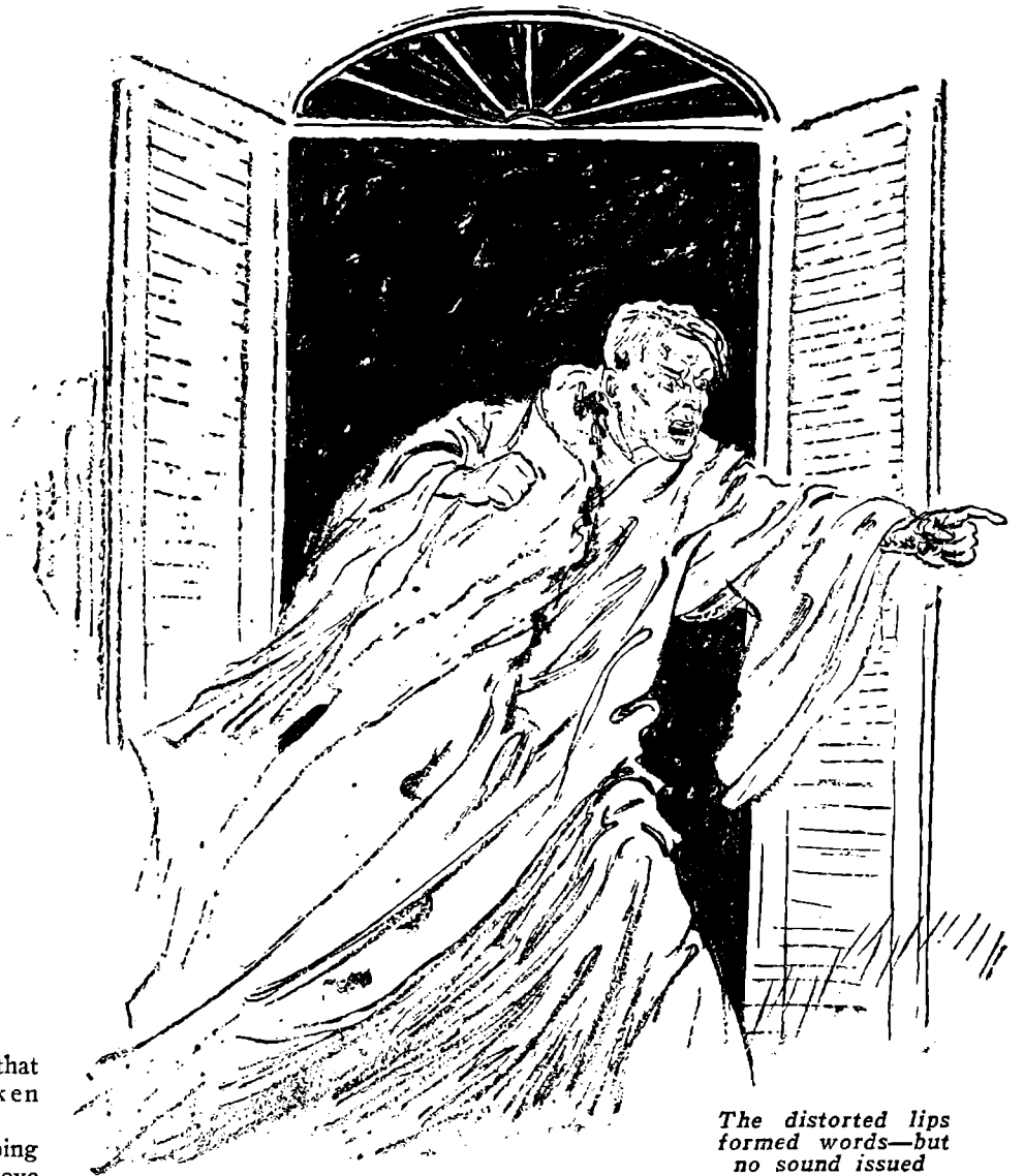
The distorted lips formed words—but no sound issued

Millions were gone from the public treasury—and Dan Moran, highway commissioner, lay dead with a bullet through his brain. Did guilt drive him to suicide? —or was he the innocent victim of a crooked political ring? It took a ghost to reveal the truth!