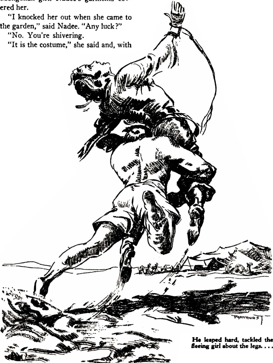
He leaped hard, tackled the fleeing girl about the legs. . . .

a deft motion, threw back the cloak. Harley felt dizzy. About her ripe hips clung a tight black girdle from which hung a piece of cloth in front. Her long legs were amazingly white in the moonlight; legs slender, yet with firm thighs and