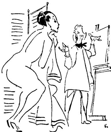
Immortality on canvas—?

would draw herself up like an offended princess if you so much as showed her a spoonful of black strap molasses. This is no hastily formed impression. I speak of what I know. I chanced, being in something of a hurry, to go for my lunch to a little restaurant across the way from Harridge's. She was there with some other girls, and I gathered from their conversation that she had won the store Derby sweep and was celebrating. And did she celebrate! Hors d'oeuvres, soup, some kind of fish and two goes at the Hungarian goulash. And when she topped it off with strawberry shortcake smothered in whipped cream, I knew that I had found my affinity. My heart stood still."