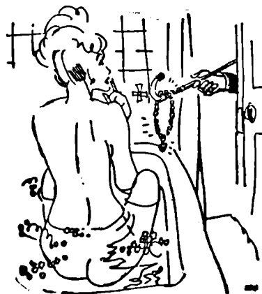
Baubles from Tiffany's—?

Two courses were open to him. He could withdraw from the contest, leaving Mr. Galloway to carry on as planned, or he could continue to pursue his wooing. Love suggested the latter policy, Prudence the former. If, Prudence pointed out, Mr. Galloway were to discover one morning that his nephew had just married the girl whom he, Mr.