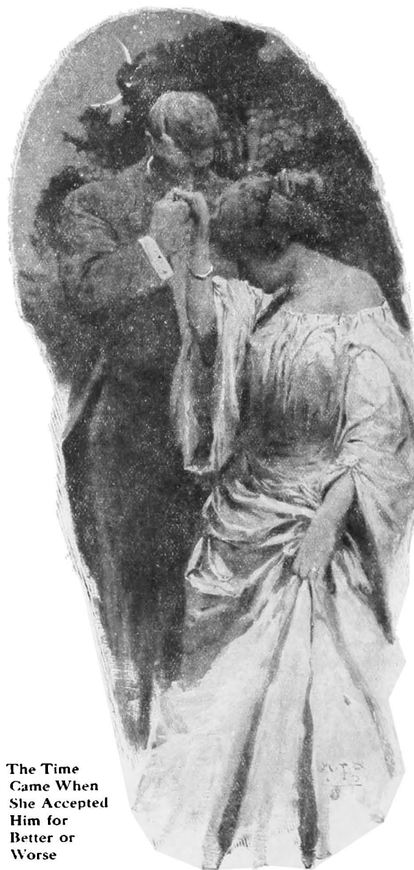
The Time Came When She Accepted Him for Better or Worse

And again he saw the thing that was like a naked man, running swiftly and lightly and singing as it ran. Opposite him it paused, and his heart stood still. But instead of coming toward his hiding-place it leaped into the air, caught the branch of a roadside tree and swung swiftly