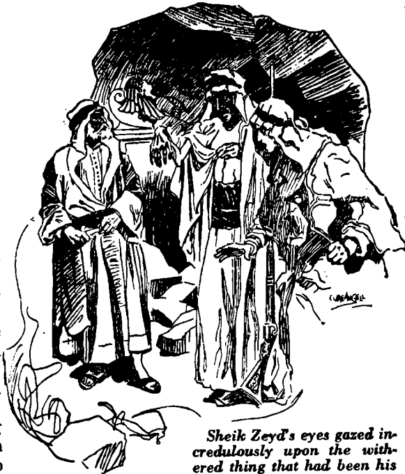
Sheik Zeyd's eyes gazed incredulously upon the withered thing that had been his hand

"You have not the vision, O Sheik," said the dervish to Zeyd.