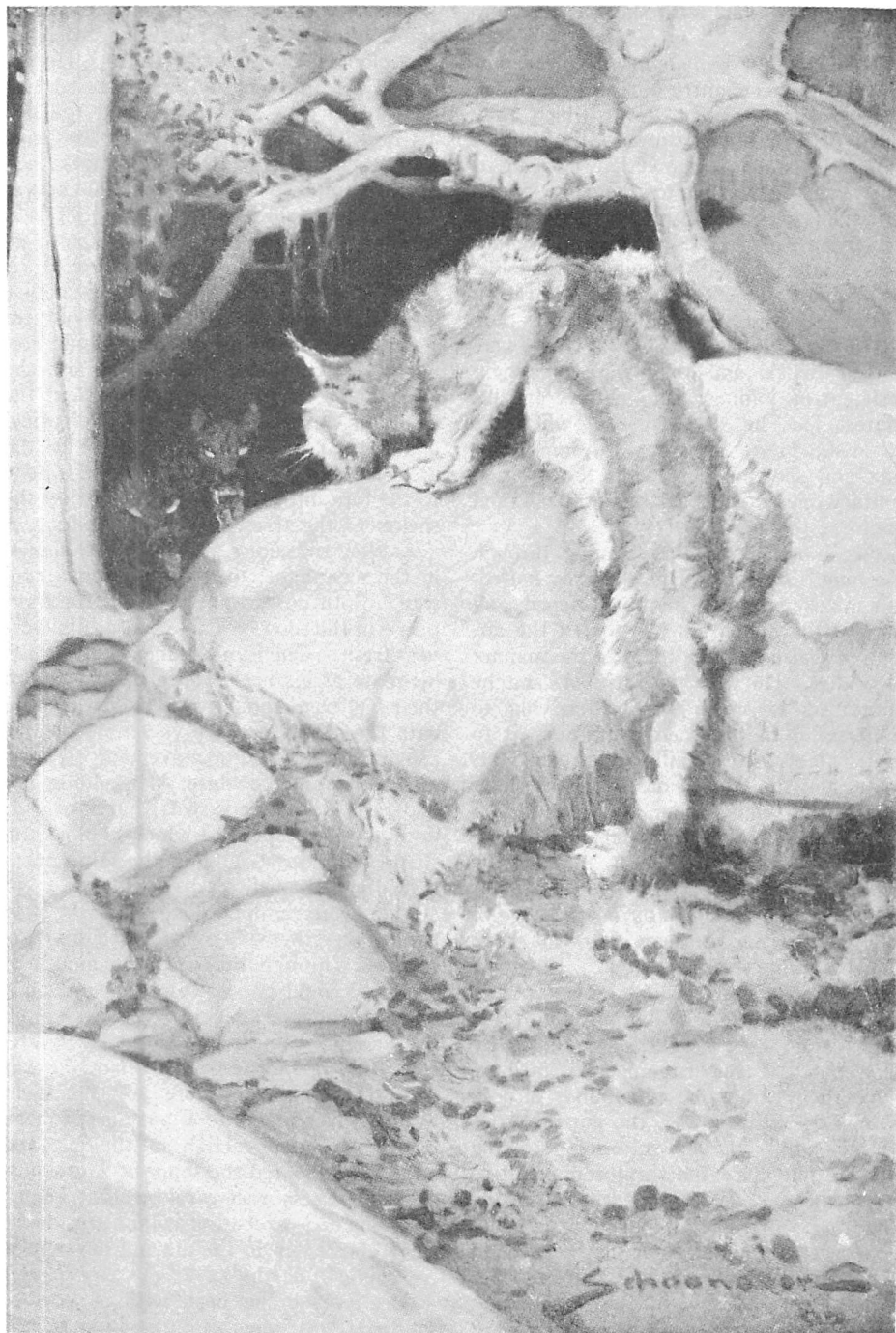
"In the full glare of the afternoon light, crouching in the entrance of the cave, the cubs saw the lynx mother."