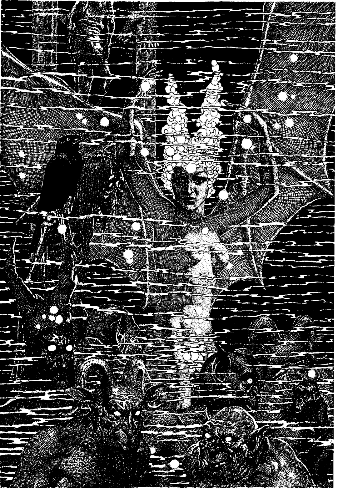
She was an eerie, yet lovely, creature of unnamed regions