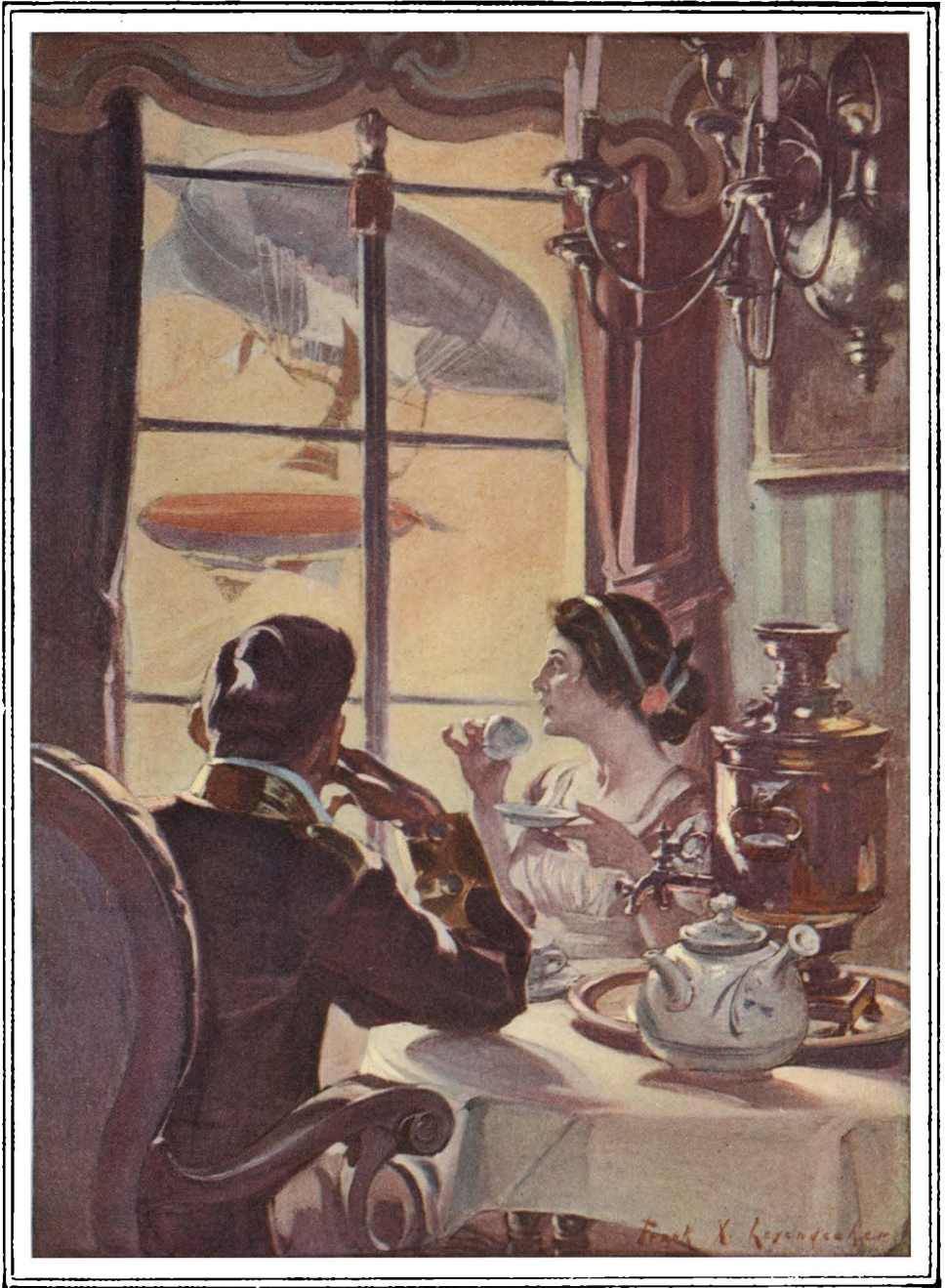
“I’VE ASKED HIM TO TEA ON FRIDAY”