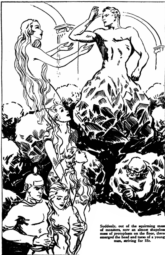
Suddenly, out of the squirming mass of monsters, now an almost shapeless mass of protoplasm on the floor, there emerged the head and torso of a young man, striving for life.