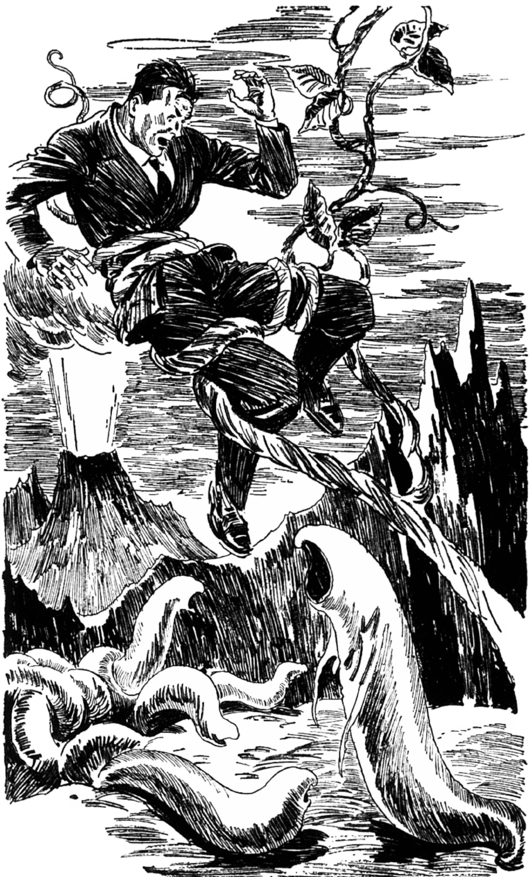
A leafy python wrapped around him, squeezing, writhing like a living antagonist