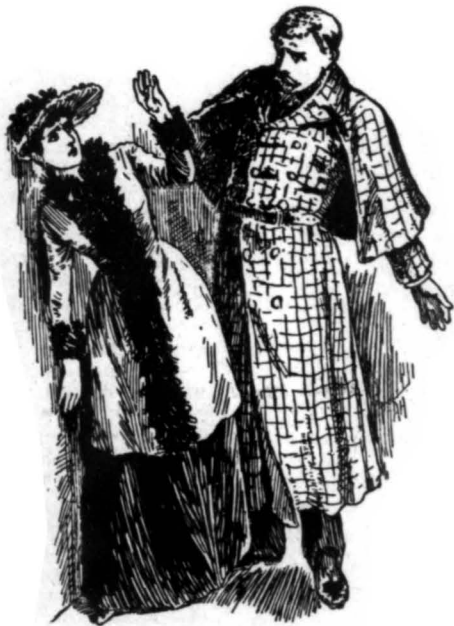
"IT WAS TIM," NOÉMIE GASPED.

"I'll forgive it all and forget it all," she said, with her lips to his ear, "if you'll only forget and forgive poor Noémie's crime."