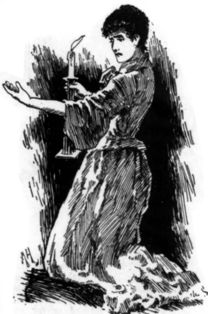
HER PALM WAS RED WITH BLOOD.

haps M. Laurent does the same. Heigho! I shall be glad when Terry comes back. There will be only one month more and then Paris—and love—not the ennui of pretending to love when one is tired."