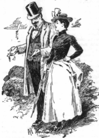
THE CHEF AND THE MAID APPROVED OF THE ATLANTIC.

They were replaced by cheerful, buxom young maids and stalwart serving-men from Londonderry, who bore the appalling dullness for a longer or shorter period that varied with the charms of the women-folk; still, in one way or the other, the service of the house was suitably conducted, and, in addition to the French servants, Tim, an old adherent of Terry, remained from first to last through the many changes in the servants' hall. And outside, the peasants, who had received and expected nothing from