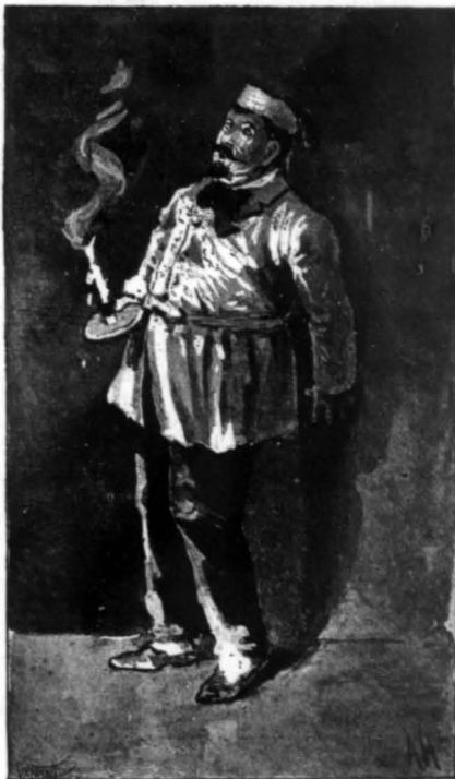
"THE POOR FAT FELLOW IS A COWARD."

"Terry," she said in a whisper, "why did you go away from me? Why did you bring me here? But learning to shoot was my fault, and if I had not learned, I should not—have—done—this. Perhaps they will hang me, and then you will be sorry that you got tired of me, and went away angry—and stayed away so long. And I will confess to no one but you what I have done—not to Suzette, who would scream and faint; not to M. de Laurent, who thinks a woman's hand should bear nothing but a rose; nor to my father, who hated my marriage, and Wrostella . . . and so if no one comes to take me away, Terry, I will