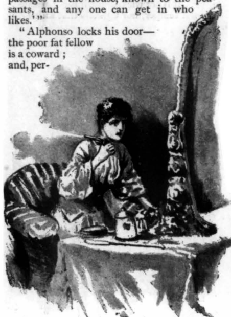
SHE POINTED THE MUZZLE OVER HER SHOULDER, AND FIRED.

"Alphonso locks his door— the poor fat fellow is a coward; and, per-