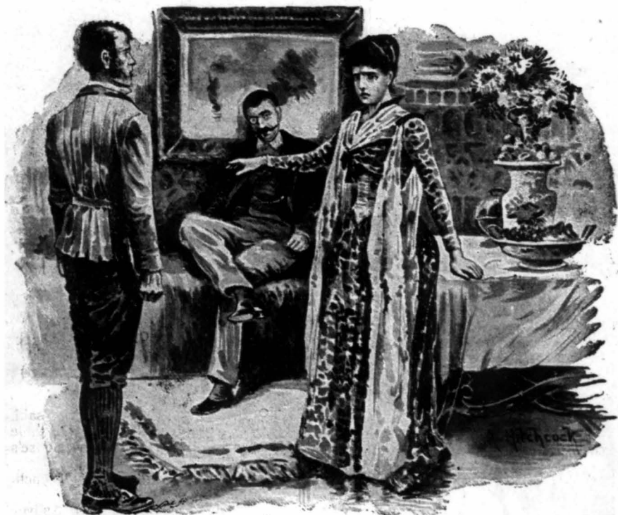
SHE POINTED HER HAND TO HIS BREAST AND SAID, "THAT IS BLOOD."

"M. Fitzgerald is detained," said Noémie gravely; "he is grieved to appear inhospitable towards you."