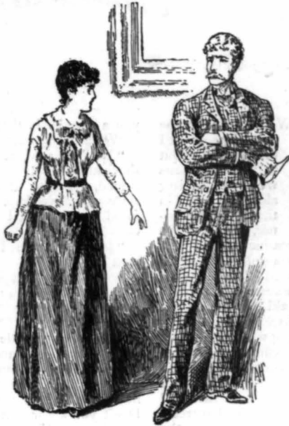
"I WISH YOU WERE AT THE BOTTOM OF THE SEA."