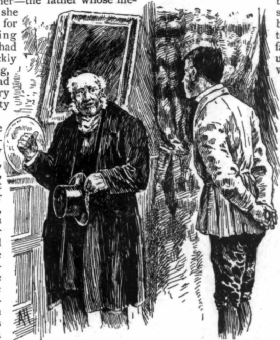
"DOES HE WALK STILL?" THE DOCTOR SAID.

He answered not a word, and her courage rose.