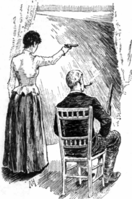
IN THE SHOOTING GALLERY.

Suzette shared in her mistress's feeling, so lowering were the glances cast upon her frivolous self and Alphonse in their walks abroad, glances that were not even appeased by the gracious permission he afforded the peasants to come up to the castle for such food as over-flowed its inmates' needs. Alas! their wants were too colossal to be satisfied by broken bread, and all along the sea-board, covering an area of nearly one thousand square miles, the same utter destitution prevailed. Indeed, it was just as well that Noémie did not know, and that