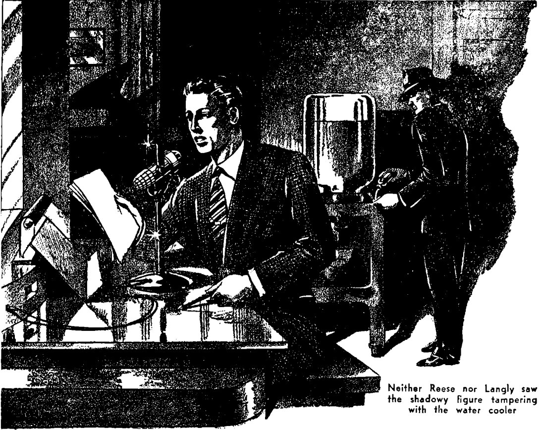
Neither Reese nor Langly saw the shadowy figure tampering with the water cooler

ers. This is a time for every man to remain alert and on the job. Mellow's liquors have been carefully aged under the finest conditions. No harshness. No headaches the morning after."