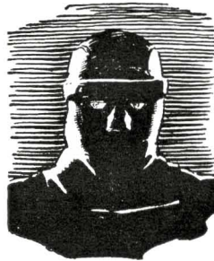
The hooded death threatened them both.