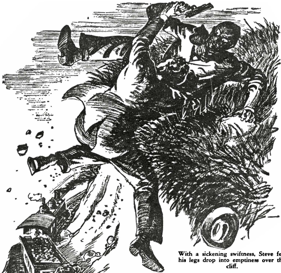
With a sickening swiftness, Steve felt his legs drop into emptiness over the cliff.

Steve waked and folded the letter away. "It's just . . . nothing. Let's . . . have a drink."