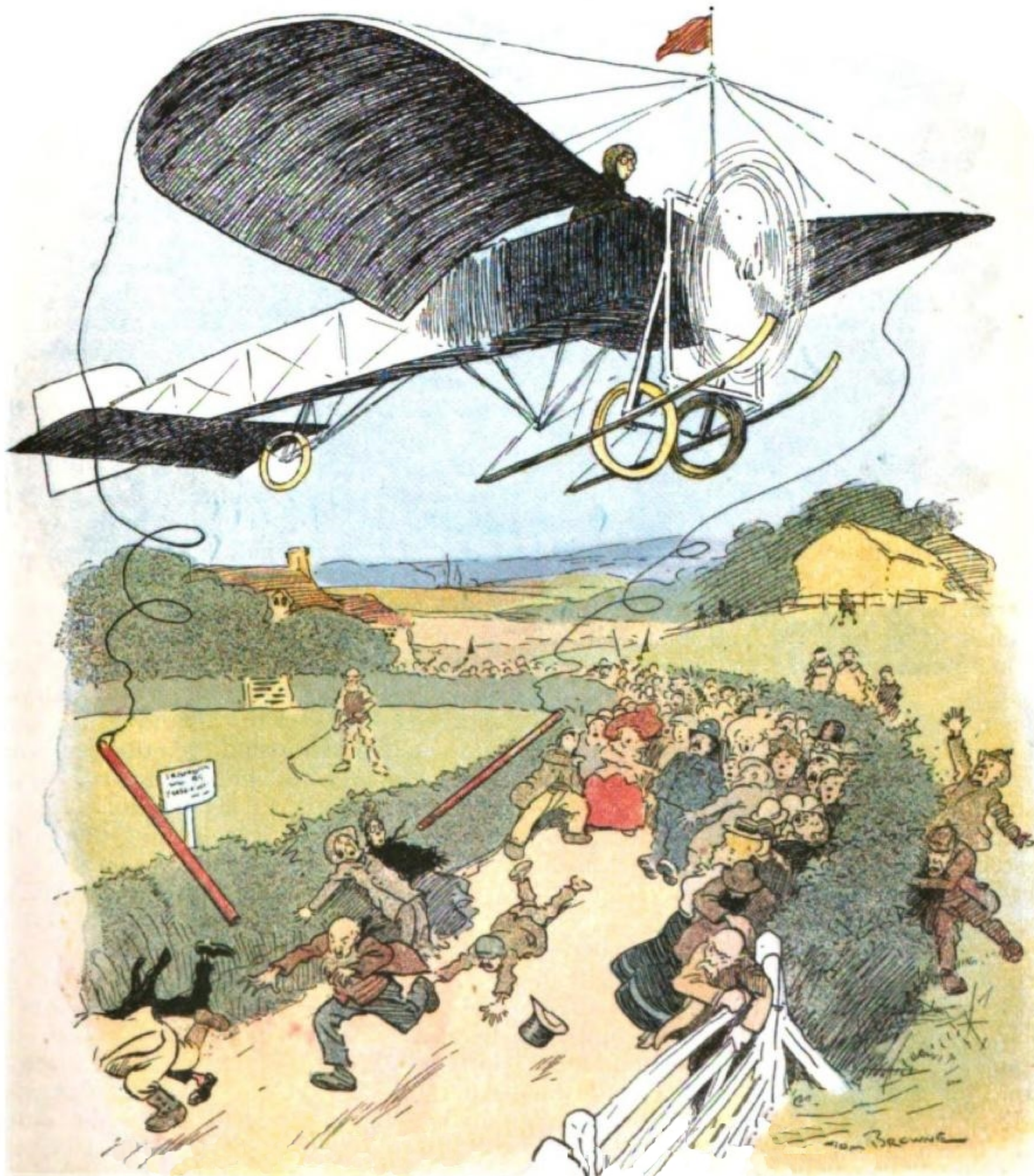
"THEY WERE TRAILING AND DANCING AND LEAPING ALONG BEHIND ME."

I had just a glimpse of brave little mother,