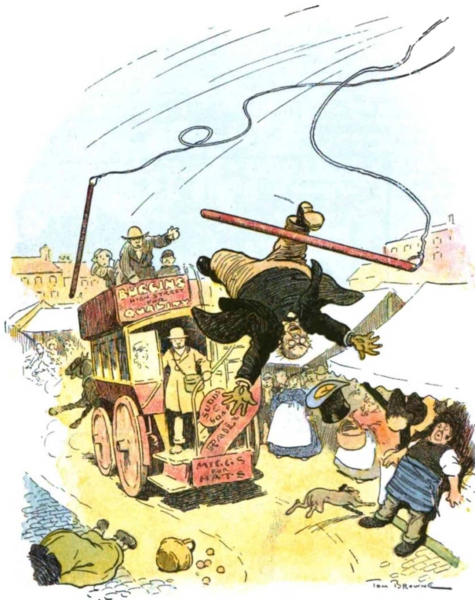
"KNOCKING OLD DUDNEY OFF THE STATION BUS."

thing well in hand, came swooping round over his piggeries to give Mintonchester a second taste of my quality.