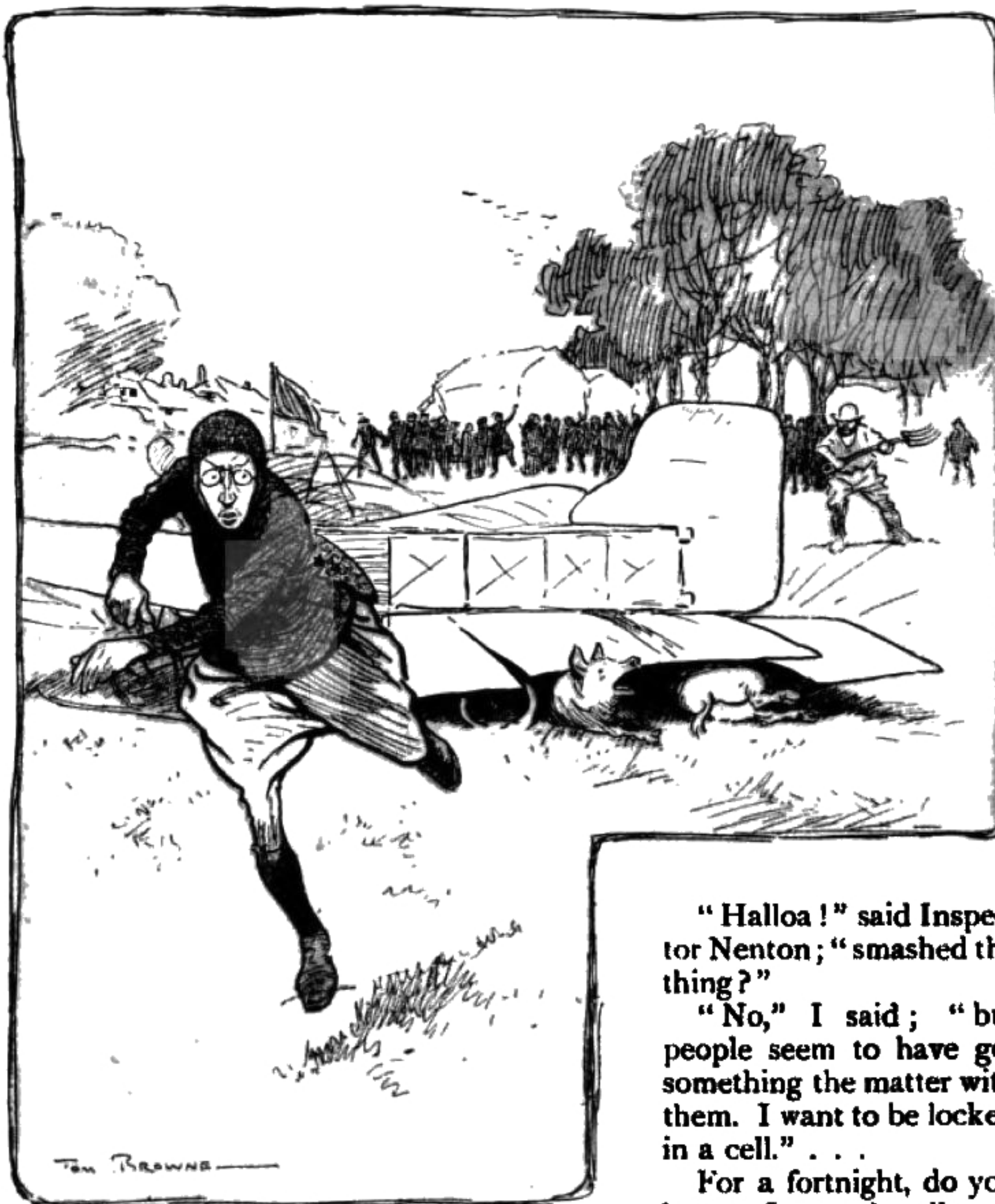
"I DROPPED OFF POOR 'ALAUDA MAGNA' LIKE A SHOT."

garden fork, with the evident intention of jabbing it into my stomach. I am always pretty cool and quick-witted in an emergency. I dropped off poor "Alauda Magna" like a shot, dodged through the piggery, went up by Frobisher's orchard, nipped over the yard wall of Hinks's cottages, and was into the police-station by the back way before anyone could get within fifty feet of me.