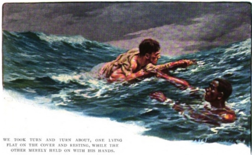
WE TOOK TURN AND TURN ABOUT, ONE LYING FLAT ON THE COVER AND RESTING, WHILE THE OTHER MERELY HELD ON WITH HIS HANDS.

Jeanne. Captain Oudouse must have succumbed to exhaustion, for several days later his hatch-cover drifted ashore without him. Otoo and I lived with the natives of the atoll for a week, when we were rescued by a French cruiser and taken to Tahiti. In the meantime, however, we had performed the ceremony of exchanging names. In the South Seas such a ceremony binds two men closer together than blood-brothership. The initiative had been mine, and Otoo was rapturously delighted when I suggested it.