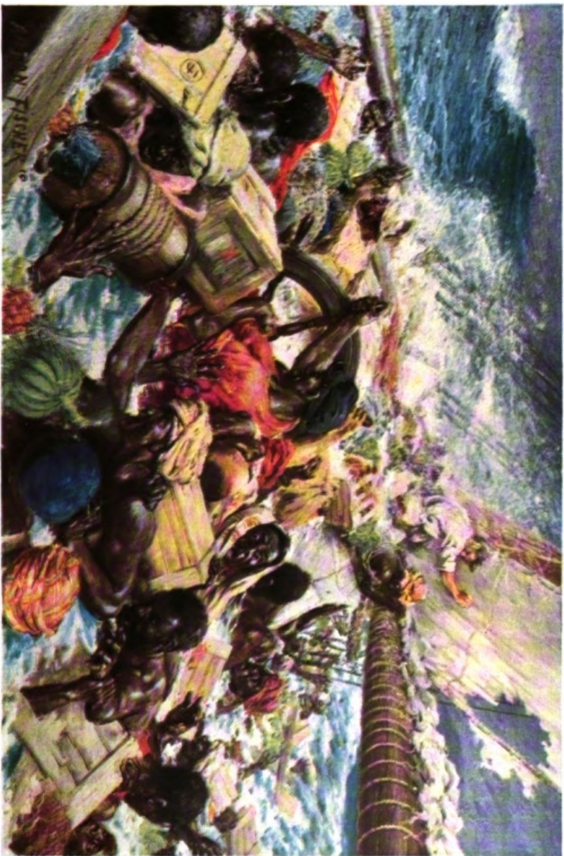
THE WOMEN AND CHILDREN, THE BANANAS AND COCONUTS, THE PIGS AND TRADE BOXES, THE SICK AND THE DYING, WERE SWEEPED ALONG IN A SOLID, SCREECHING, GROANING MASS.