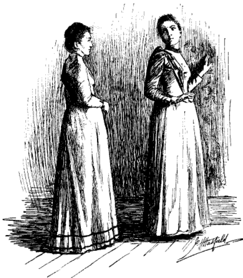
"She didn't know I was in the Room."