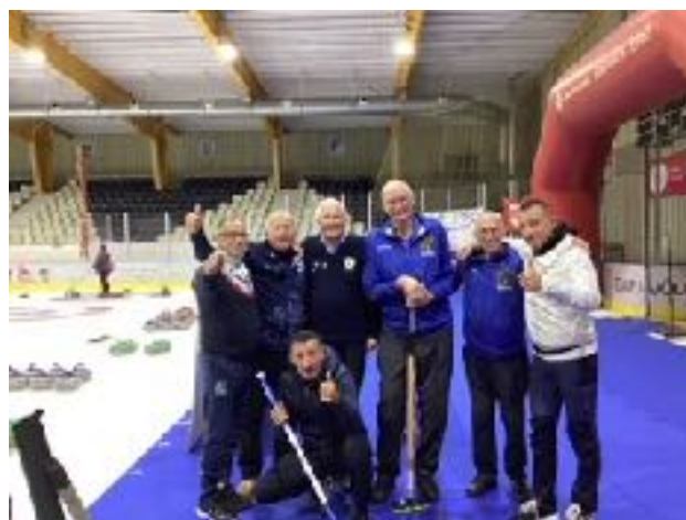
The Roaring Stones with their French opponents after their enjoyable match

The Swedish team were unbeaten and won the trophy along with a very large ham each! Fancy a curling weekend in Europe - the next bonspiel is October 10th, 11th, and 12th, 2025.