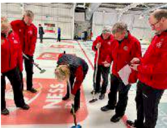
'EFFECTIVE SWEEPING' A MASTERCLASS