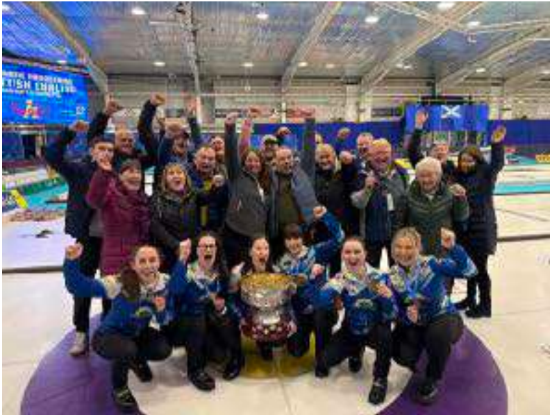
another great picture from Dumfries.