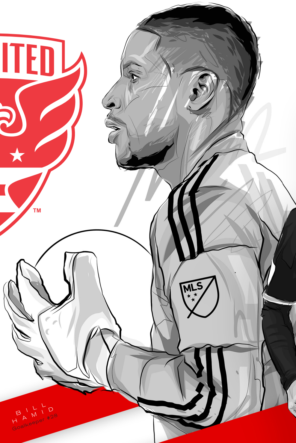
BILL HAMID Goalkeeper #28