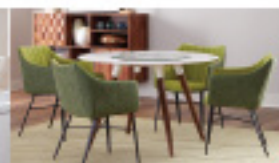
ROOM BY ROOM