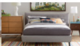
PIECE BY PIECE