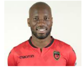
11 | Didier Drogba