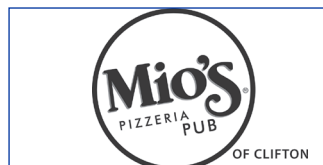
MIO'S PIZZRIA PUB OF CLIFTON