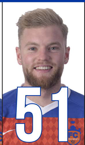
ESEM DE WIT DEFENDER