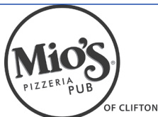
MIO'S PIZZERIA PUB OF CLIFTON