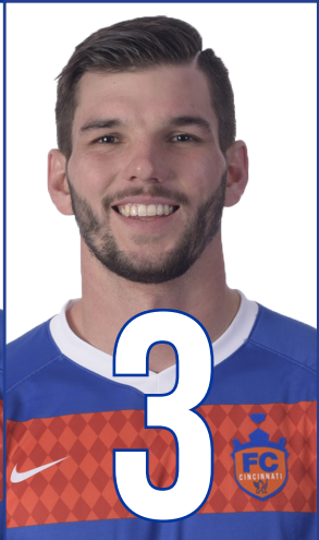
FORREST LASSO DEFENDER