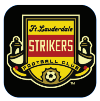
Get the Qserv app