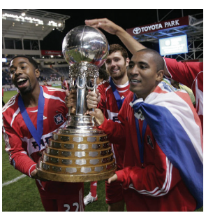
HISTORY - The Fall River Rovers (top) and Chicago Fire (bottom) with the original Dewar Cup trophy.

operated by higher level professional teams are ineligible to compete, which bars nine USL teams from the tournament), amateur clubs from all over the US also enter, bringing the total for 2016 to 91 teams.